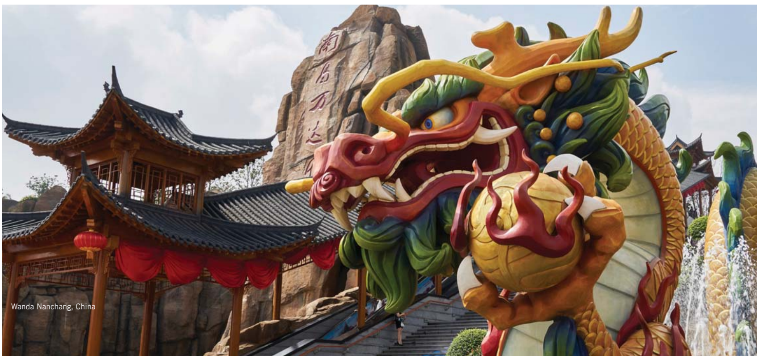
Wanda Nanchang, China