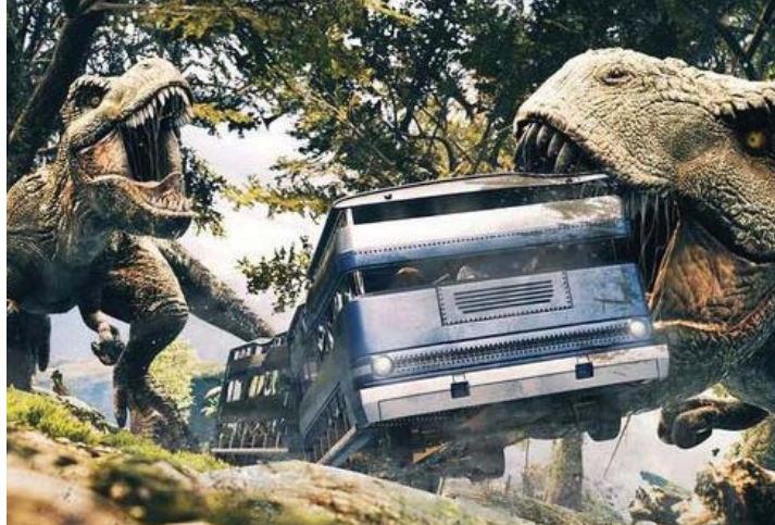
● Jurassic War takes guests on a thrilling dinosaur adventure

The experience begins with an immersive pre-show walk-through, featuring lifelike animatronics, and