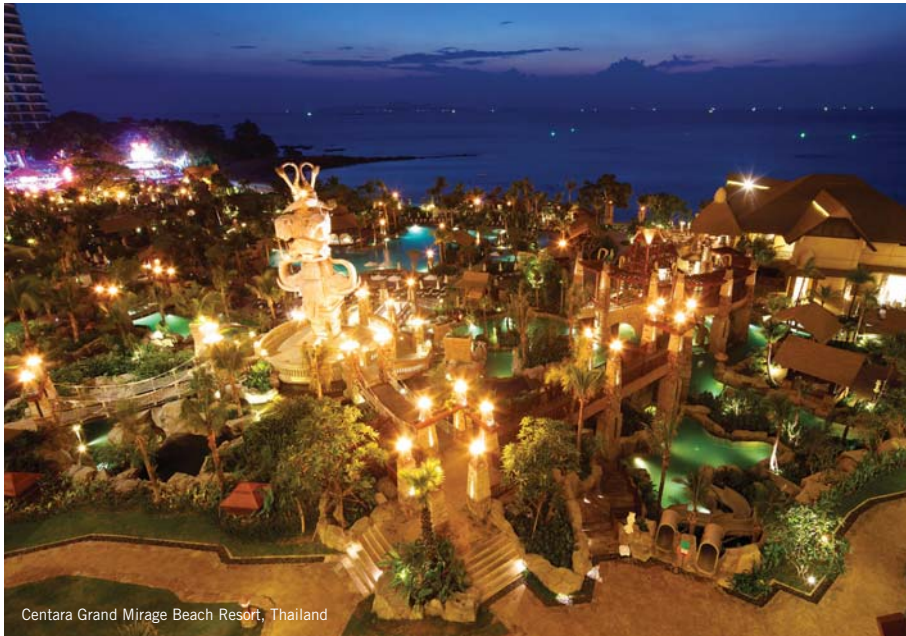
Centara Grand Mirage Beach Resort, Thailand