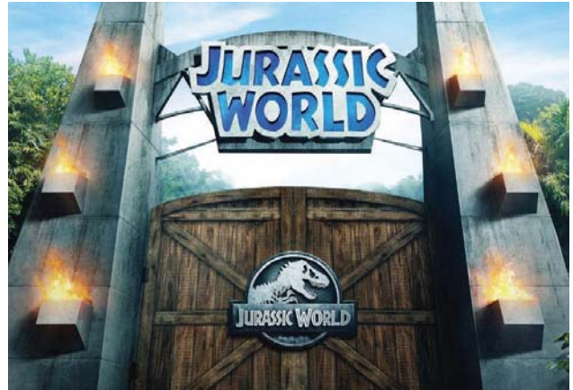
■ The attraction will be updated to match the later films