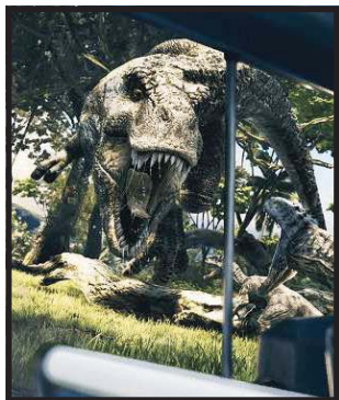
● The revamped attraction opened on 19 May

Virtual reality movie production company Red Raion has created a custom-made film to revamp the immersive tunnel attraction at Cinecittà World in Rome, Italy.