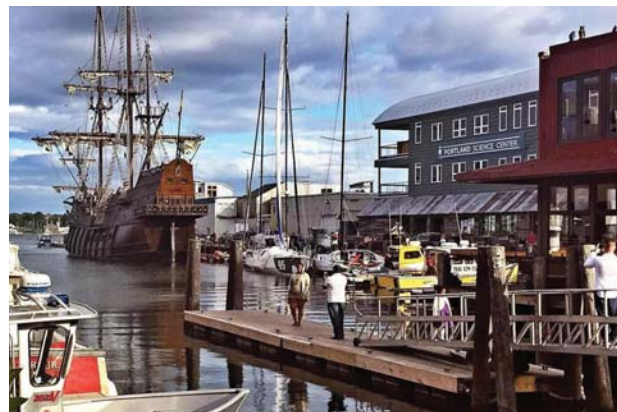
■ The science centre was situated on Maine Wharf

The science centre, which occupied 15,000sq ft (1,400sq m) over two floors, was situated on Maine Wharf,