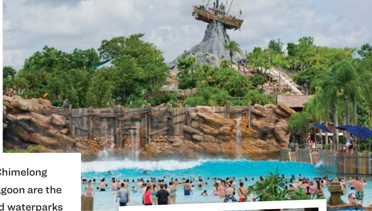
■ (lef to right) Chimelong and Typhoon Lagoon are the two most visited waterparks