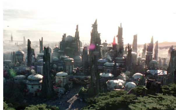
■ A cinematic preview shows the park concepts

Having been "cleared for arrival", the cinematic trailer shows animated concept imagery of the Star Wars-themed attractions, complete with TIE fighters from the franchise flying through the sky. On the right of the video is the Millennium Falcon – already confirmed to be a ride where guests pilot the starship and a battle with the First Order. Both Star Wars-inspired lands