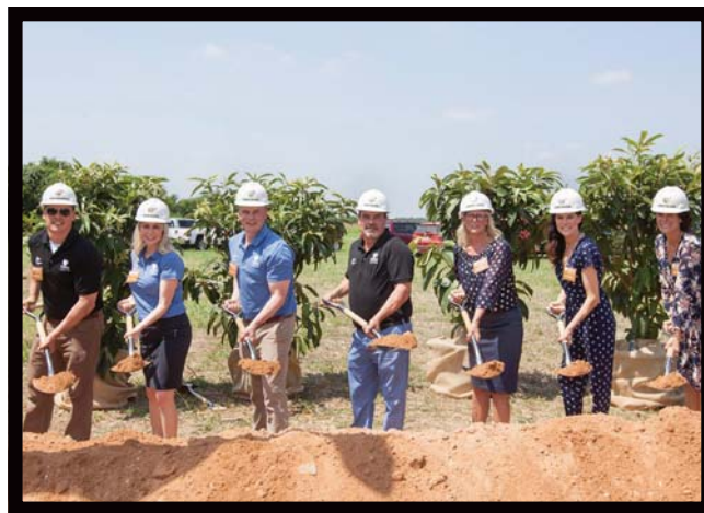
■ The resort has broken ground and will open its doors in 2020

Opening in 2020, the resort will feature a waterpark, which at 223,000sq ft (20,700sq m) will be the largest in the US. An adventure park is also included in the offering, with the 80,000sq ft (7,400sq m) space set to include thrill rides, ropes course, climbing walls, indoor zipline, bowling, laser tag and mini-golf. A selection of outdoor pools covering 130,000sq ft (12,100sq m) will also be on offer.