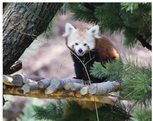
Red pandas are among the new animals on display

"The higher up you go, it becomes more evergreen forest, so you're climbing in elevation as you walk