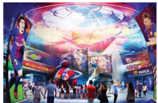
■ Five attractions will initially open in the US and Asia in 2020

"The agreement with Parques Reunidos will help us to project our image in strategic territories, offering our supporters a 100 per cent Barça experience, and at the same generating