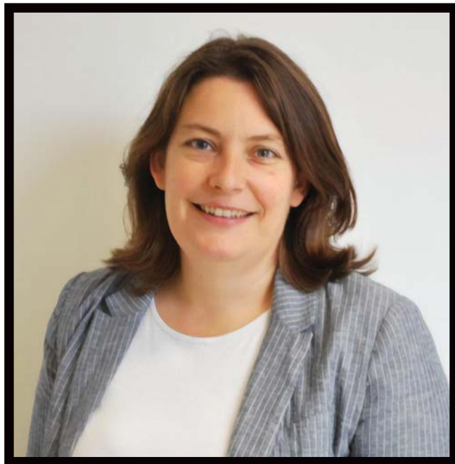
■ Pye will be responsible for eight venues

“We want to continue to be the leading example of an inclusive museum service”