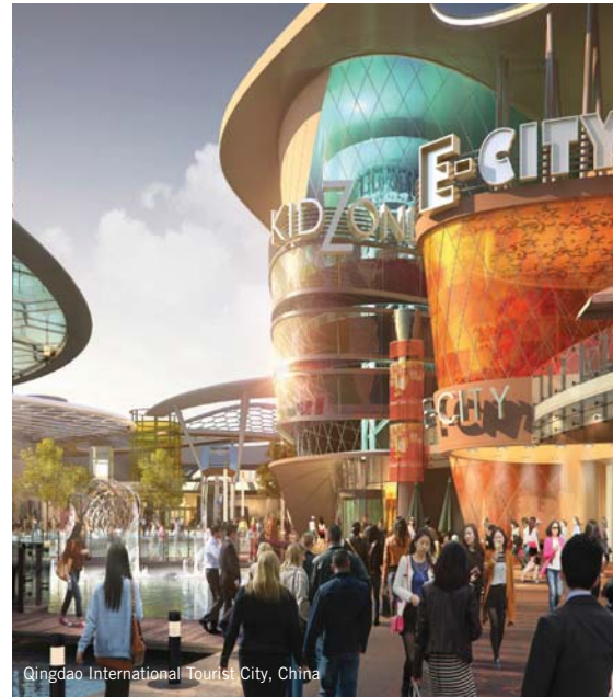
Qingdao International Tourist City, China