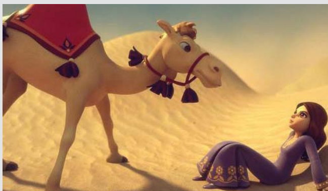
● Cinesplash 5D combines a 4D cinema with a waterpark experience

As the action unfolds on screen, the cinema floods, with a number of water effects, including rain, waterfalls, water explosions, sprays, fountains, water guns and neck blasts, which are deployed to fully immerse viewers in the experience. Additional effects, including wind effects, ground