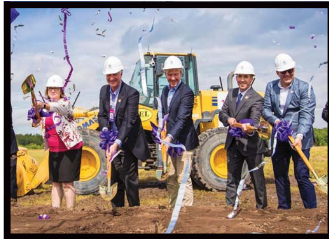
■ The organisation broke ground on the headquarters in May

"I think it makes a lot of sense, especially to all