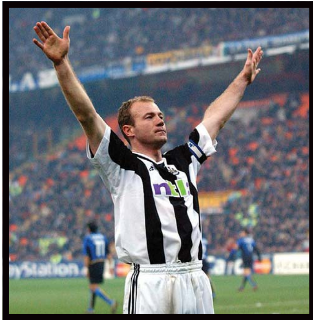
■ Alan Shearer is Newcastle United FC's record goalscorer

"It's just what the city needs – a new iconic attraction that celebrates our rich history and culture"