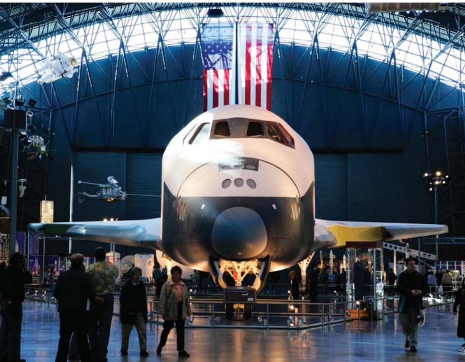
■ The National Air and Space museum is the most visited in the US

France's museums have shown significant recovery following a tumultuous 2016, with the Louvre reclaiming top spot as the world's most visited museum in the latest TEA/AECOM Museum Index