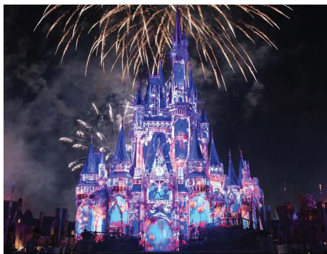
■ Visitor numbers at Disney parks continue to rise each year