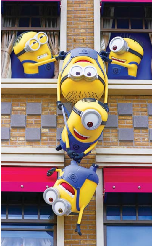
■ Minions are a big draw for Universal Studios Japan – the most visited non-Disney park on the list

visitor figures by 0.4 per cent in third, welcoming 16.6 million people to its park.