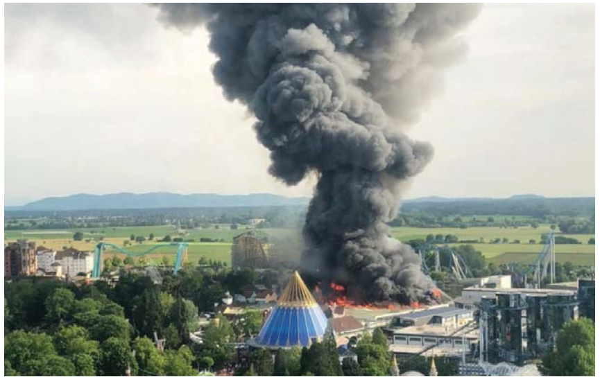
■ The fire created a thick plume of smoke that could be seen for miles

"The cause of the fire is still unclear, however the police have started their investigation," said the park in a statement to Attractions Management News . "Europa-Park cannot give any