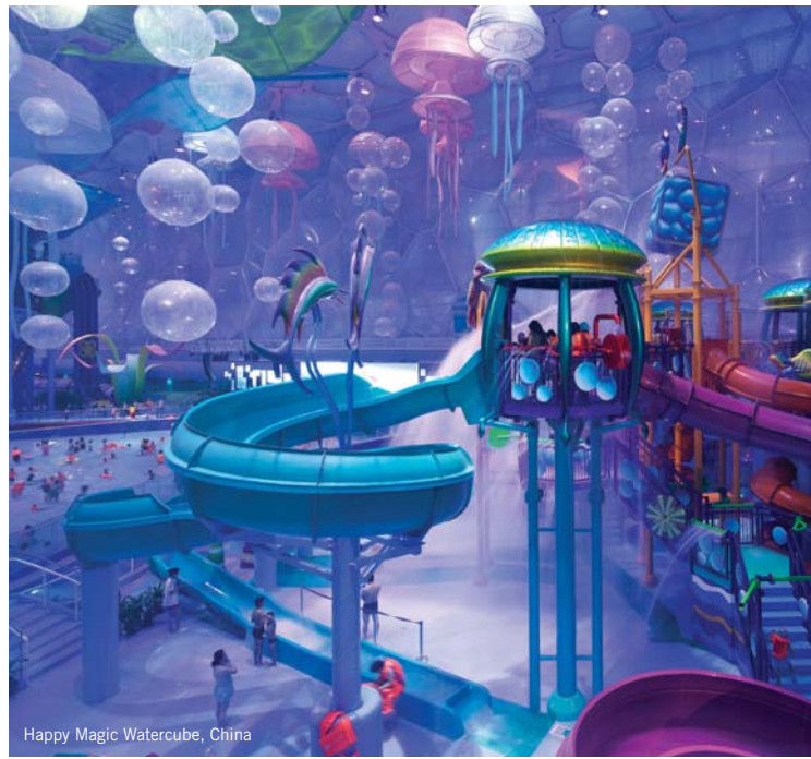
Happy Magic Watercube, China