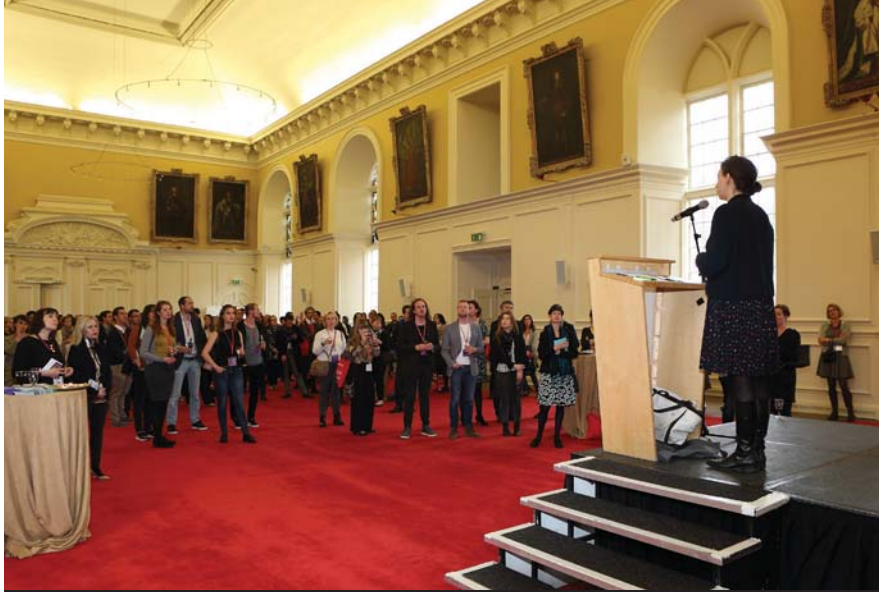
■ Learning opportunities and networking events are available at MuseumNext