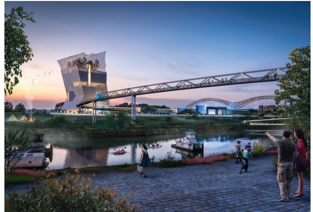
■ The aquarium would be connected by a pedestrian bridge