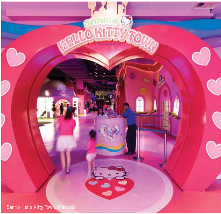
Sanrio Hello Kitty Town, Malaysia