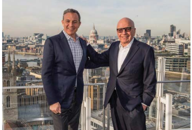
■ Bob Iger (left) and Rupert Murdoch following the original Fox deal