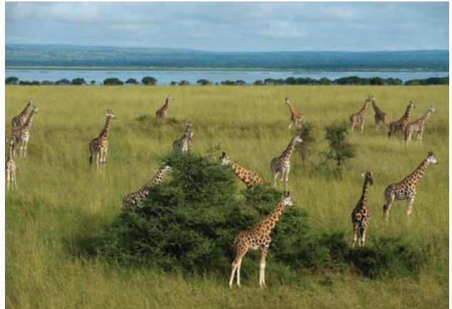
Protected areas are still being damaged by human intervention