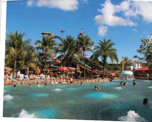
■ Thermas Dos Laranjais and Blizzard beach rank third and fourth for visits